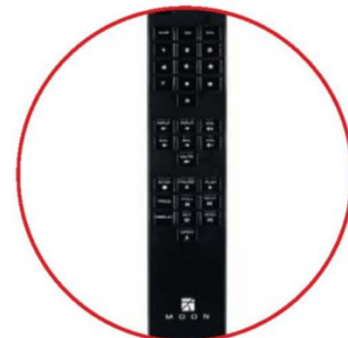
The remote control could be better designed, but is easy enough to use