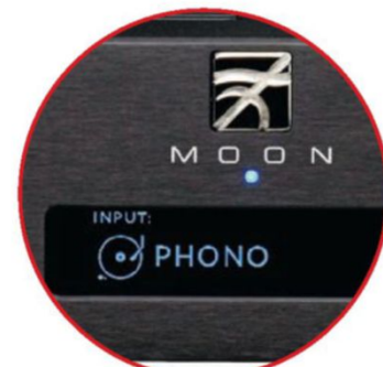
The OLED display is crisp and clear, and you have the option to turn it off