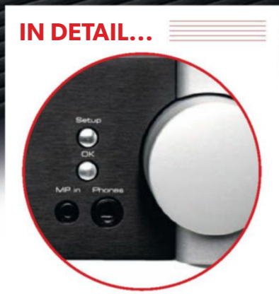
There's a 3.5mm input for your smartphone and a 6.3mm jack too

"It's rare for an amplifier to sound so engaging at low volume. Turning it up simply makes it louder - it doesn't change or harden the sonic character"