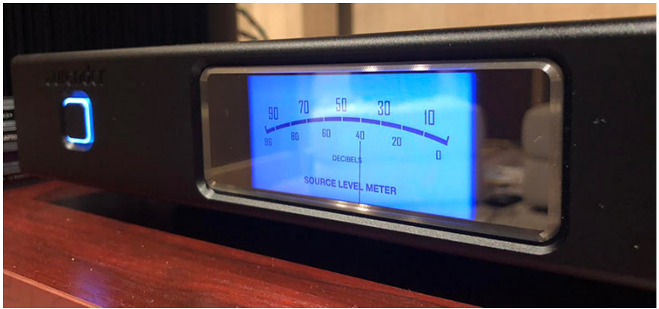
Network Music Server AMOLED Screen

This is the part of the A10 that gets rocky, the unit is finished nicely and weighs in at just over 20lbs. My biggest gripe concerns the four buttons on the front. It is almost impossible to make out their purpose. Since this unit is best controlled with an app and includes a remote, it made me wonder why they were even included in the first place, the faceplate would have looked so much cleaner without them. Now for the coolest feature; in the app, you can change the AMOLED display on the front to show a track list or a cool looking McIntosh-like meter. I loved its clean style, it was almost lifelike thanks to the AMOLED technology behind the screen. On the back of the unit we have the standard balanced and unbalanced analog outputs along with optical and USB inputs and an Ethernet port.