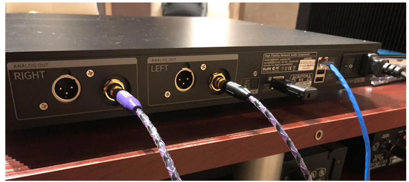
Aurender A10 Network Music Server Inputs