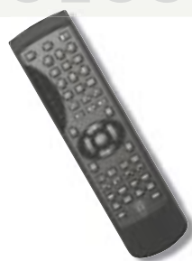
C22 REMOTE CONTROL

The C22 System Remote Control controls all Primare designs except CDI10. The simple and logical controls make it very easy to operate all the components in a Primare system.