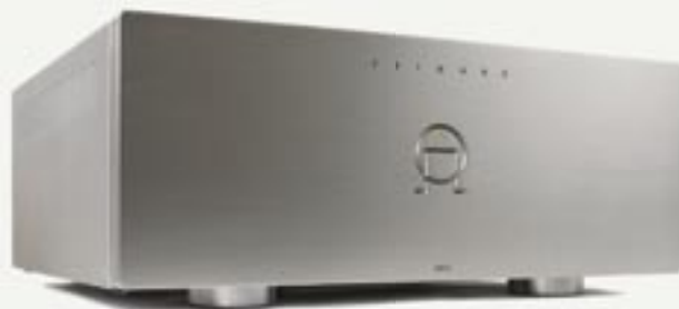
A30.5 Five Channel Power Amplifier