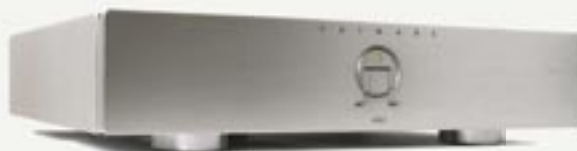
A30.2 Two Channel Power Amplifier