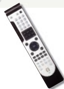
C32 REMOTE CONTROL

The C22 is the standard Primare system remote, which ships with all units.