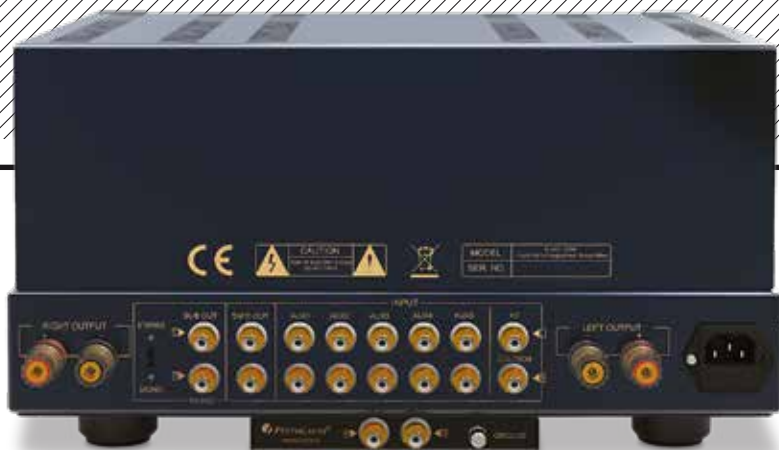
ABOVE: The EVO 300 Hybrid offers five line inputs, an HT bypass, tape out and sub/mono line outs with single 4mm speaker outputs configurable for stereo or (bridged) mono operation. Optional MM phono module also shown here

trepidation, but I was beginning to suspect that Herman had overruled Jan in the voicing of this amp – the tube front-end most assuredly is not overwhelmed by the FET output. Going all-analogue, I left CD for open-reel, opting for the exquisitely recorded Dixie Rebels' eponymous album [Command RS4T-801]. If you recognise the label, then you'll know we're in the presence of an early audiophile recording of extreme left-right stage extension, better to demonstrate stereo back when JFK was still a senator and The Beatles had yet to play in Hamburg.