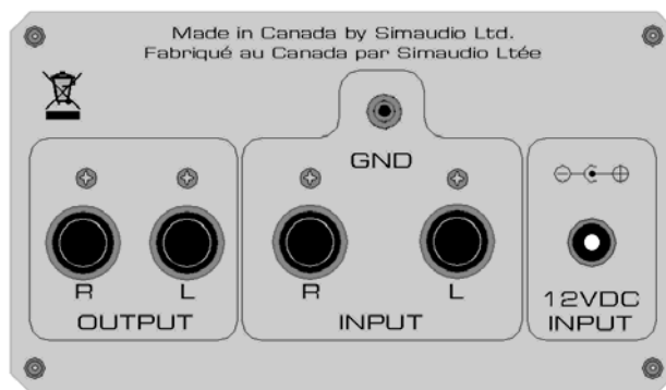
Figure 6: MOON LP3 Rear panel

The rear panel will look similar to Figure 6 (above). There is one pair of single-ended inputs on RCA connectors located in the center with a ground post directly above. Connect the cables from your turntable to these inputs and the ground lead wire to the ground post. There is one pair of single-ended outputs on RCA connectors located to the left of the inputs. Using a pair of RCA terminated interconnect cables, connect these to your preamplifier/integrated amplifier. Don't hesitate to use high quality interconnects. Poor quality cables can degrade the overall sonic performance of your system. Finally, on the right side is the power supply input connector, labeled "12VDC INPUT" for use with the included power supply.